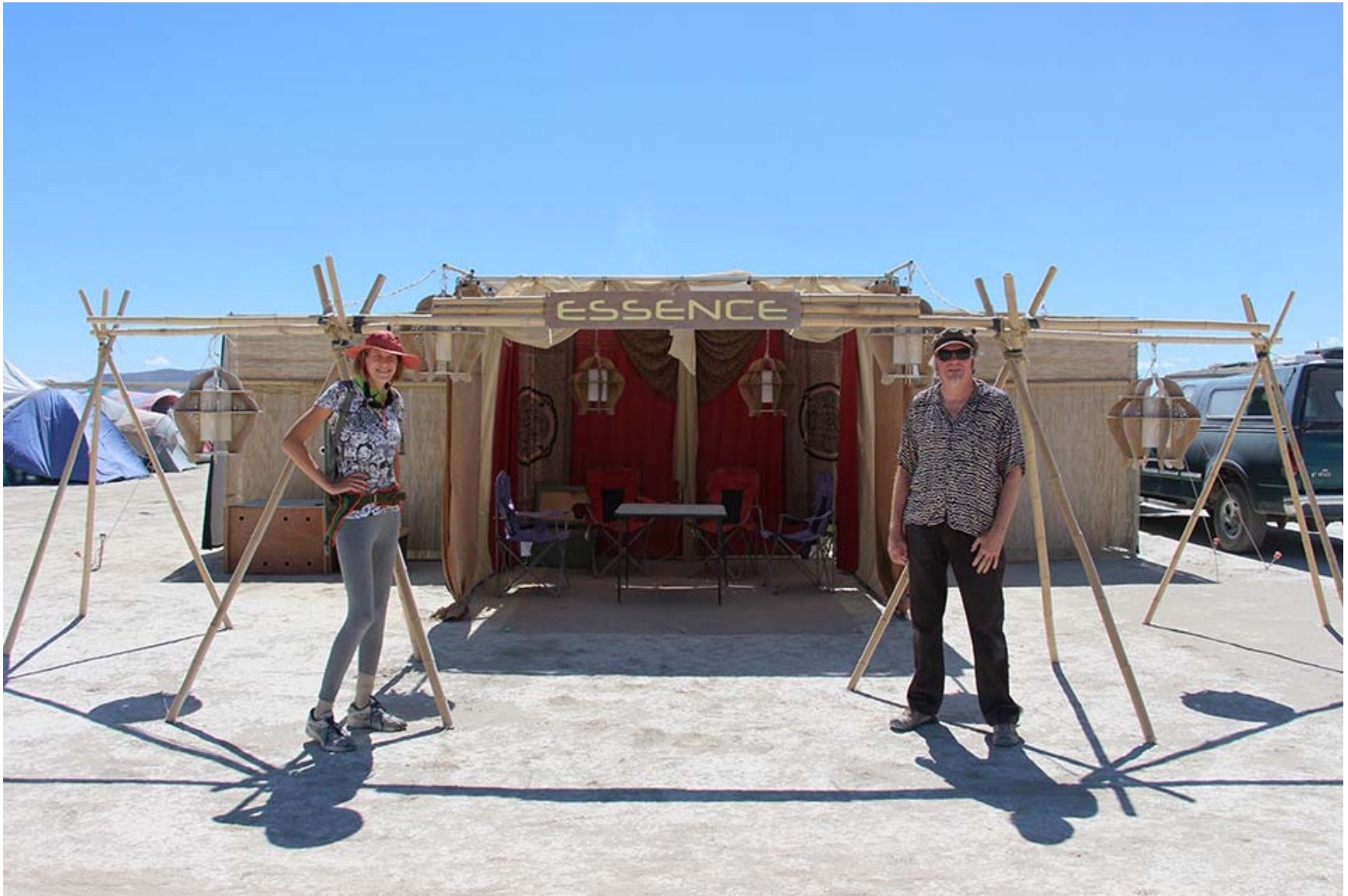
Essence Camp at Burning Man 2015