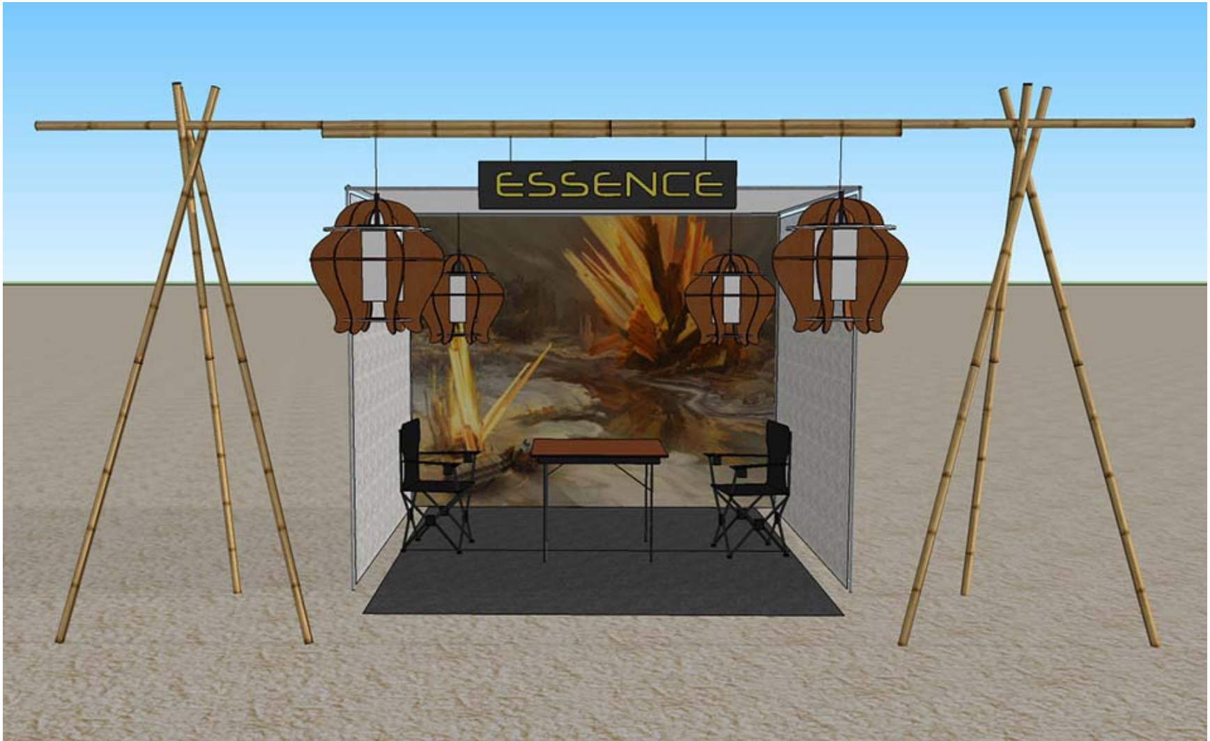
Night time Front View of Installation (Card Room and Light Seed Lamps)