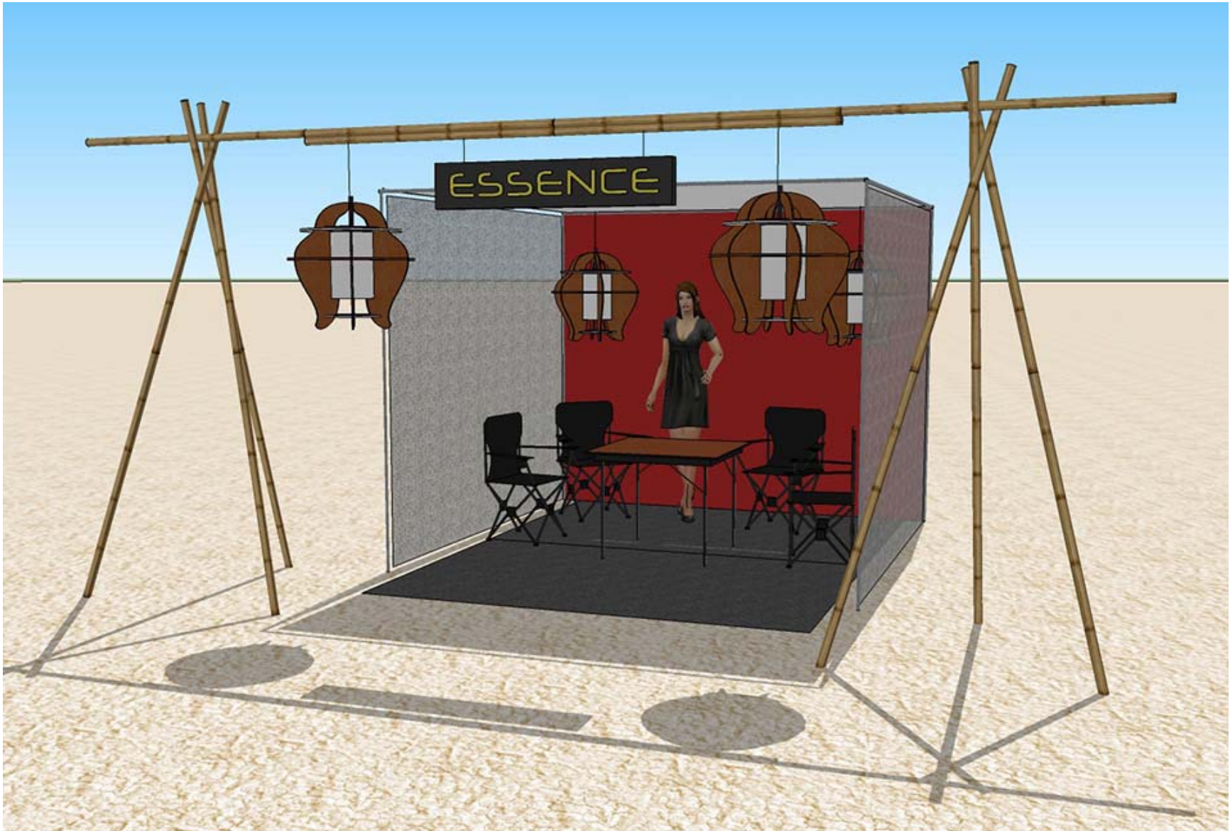
Daytime Front View of Installation (Card Room and Light Seed Lamps)