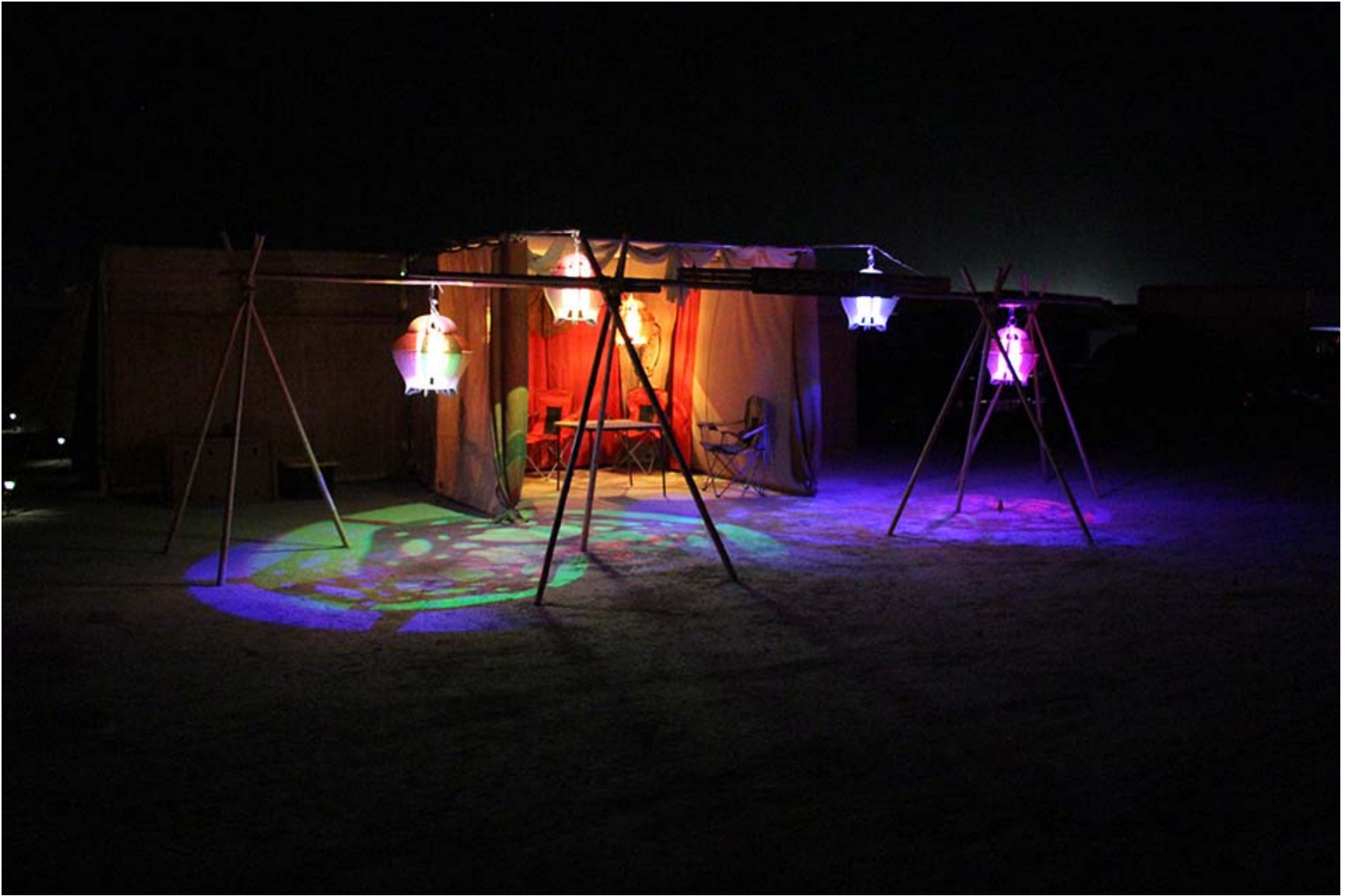
Essence Camp at Burning Man 2015