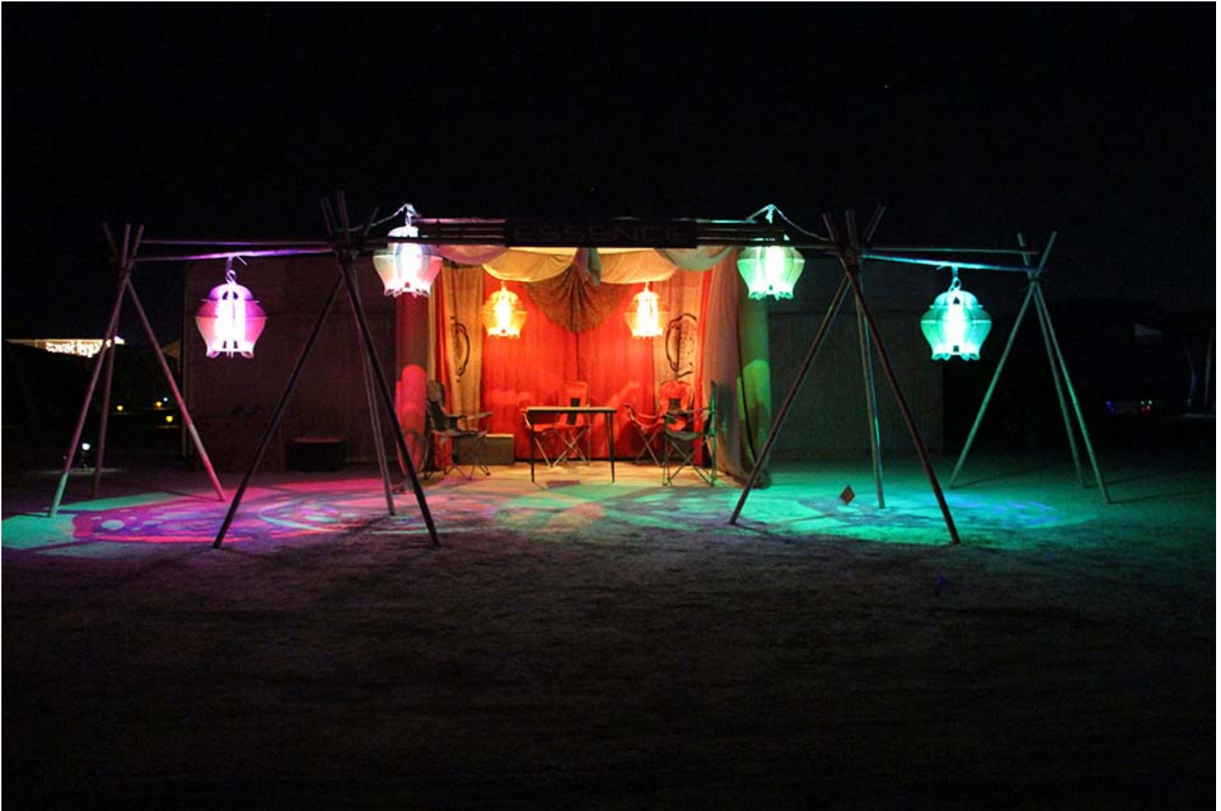
Essence Camp at Burning Man 2015